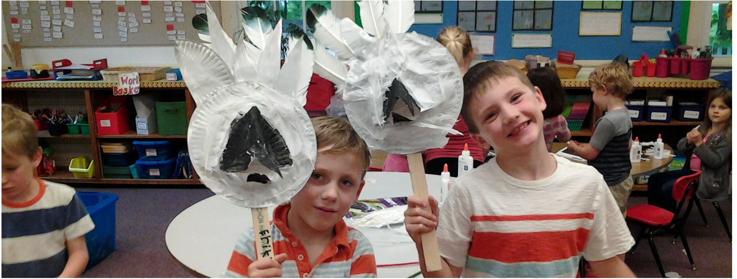
STUDENTS SHOWING OFF THEIR CREATIONS!

Next, in 2017, they plan to study raptors, including owls. Contributions of owl pellets, if you find some, would be especially welcome. They will be studied under the microscope, and the tiny skulls and bones that are remnants of the owls' dinners will be immortalized in art. ♦