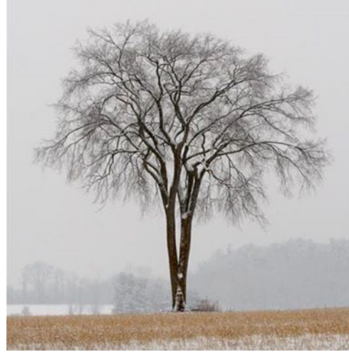
THE BALDWIN HILL ELM

Look for our calendar of events and note that contact information is available. To join ELT print and fill out the Membership Application, and please include your email address. We do not share membership information with anyone, no matter how worthy the cause.