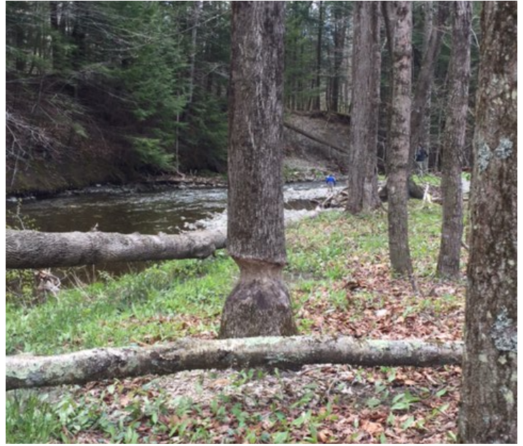
IMPRESSIVE BEAVER WORK SEEN ON THE WILDFLOWER WALK

Carpooling is encouraged. Meet at the ELT owned field on Rt. 71 about a half mile north of the North Egremont Store. You'll see our ELT sign on a post there, on the right. Pull into the field to park. ♦