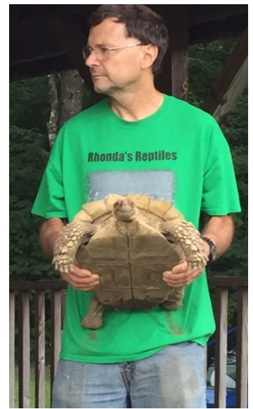
AFRICAN SPUR THIGH TORTOISE