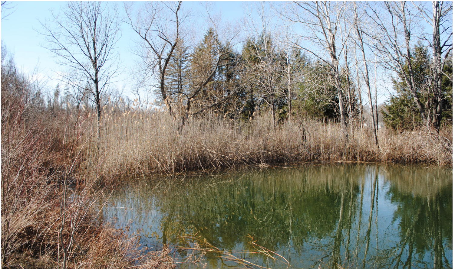
PHRAGMITES AT THE FEN