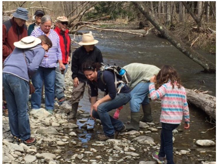
EXPLORING GREEN RIVER