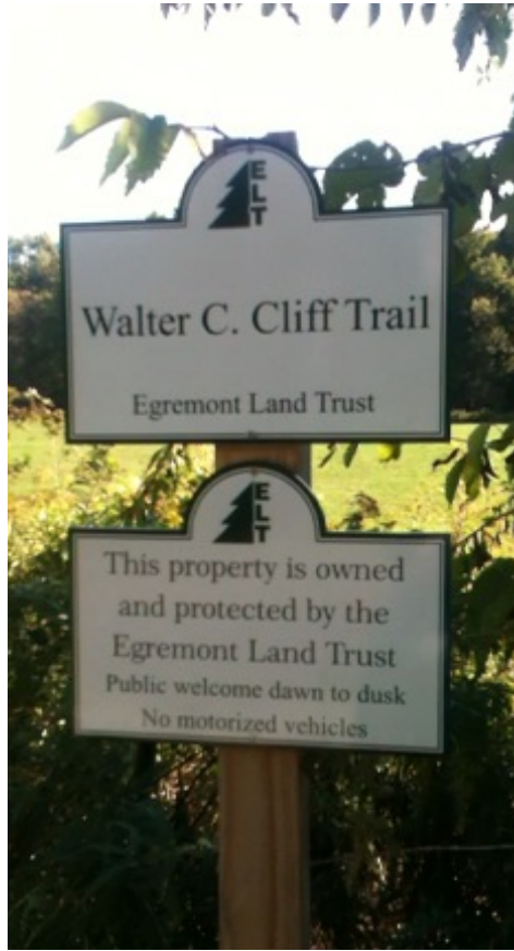
WALTER C. CLIFF TRAIL

At our Route 71 site, 0.5 mile north of the North Egremont Store, the Greenagers created a trail from the forest edge to the Green River. We named the trail in honor of long-time, but now retired, board member Walter C. Cliff (see photo at right). The