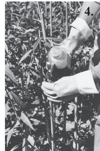
Reading clockwise from above left: 1. Volunteers paused periodically for cool drinks on a hot summer day. 2. Some of the work took poace in the water at the edge of the pond. 3. Barbara Greene, ELT board member, was one of the land-based workers. 4. Work for experts: TNC interns carefully dripped the herbicide into the hollow stems of the phragmites.